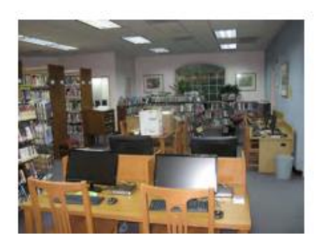
Public comps crammed into area with other materials