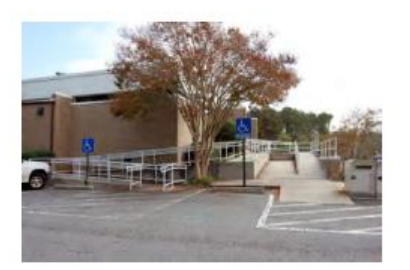
ADA ramp difficult to navigate