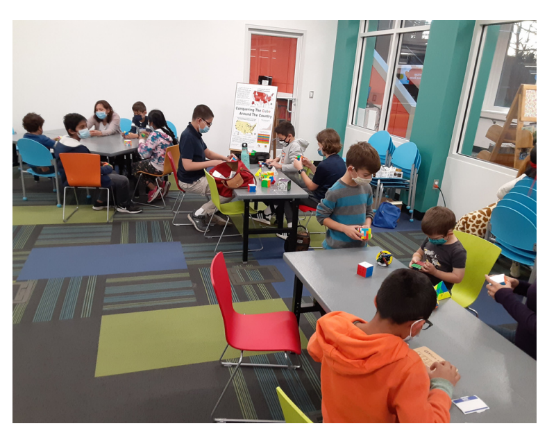
Cobb County Public Library patrons taking part in the Cubing Hangout program.

participants' strong interest. As the months have gone by, I've been incredibly proud to see many attendees go on to compete in official speedcubing competitions, with one particularly talented teen placing third overall in just his second competition!